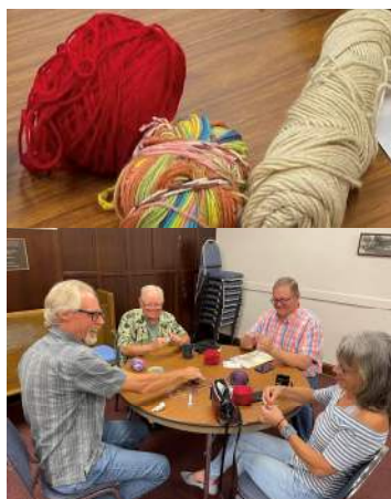
FCC Summer Fun and Fellowship July 9th - Making Camp Crafts

Please let us know if we have left anyone off of the birthday list!